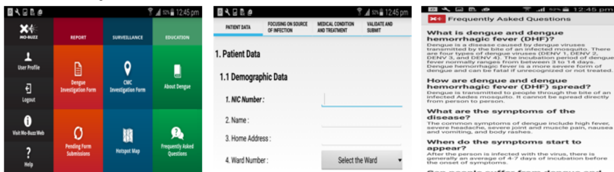
Figure 1. Screenshots of the Mo-Buzz for Public Health Inspectors application. Home page, Dengue Investigation Form (DIF), Frequently Asked Questions (FAQ) (left to right).

On the basis of the Mo-Buzz research team's formative needs assessment interviews and the proposed solutions, the Mo-Buzz system that was developed for PHI use digitizes the three main roles of the PHIs: (1) recording field and site visit information (digitized surveillance), (2) keeping track of outbreak clusters in their regions (digitized dengue monitoring and mapping), and (3) providing dengue-related information to members of the general public (digitized dengue education). Each of these is described in turn below. Figure 1 shows the iPad (Apple Inc) view of the Mo-Buzz app for use by PHIs.