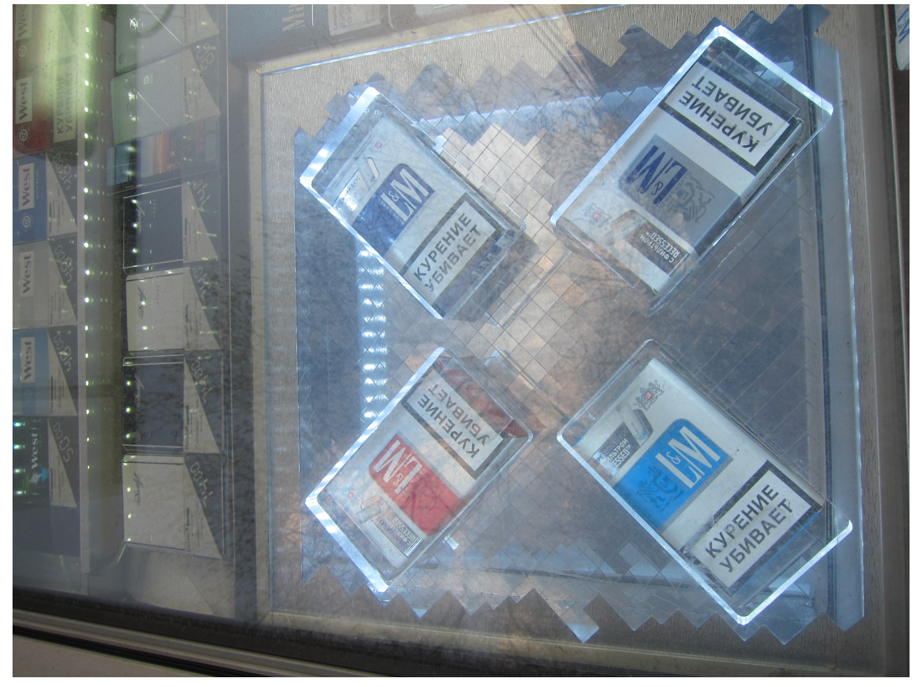
Figure 1. Cigarette packs displayed in a lightbox, Moscow, April 17, 2014.

the implementation of product advertising and promotion and product displays, which provides insight into the tobacco industry's marketing efforts and optimal policy design. Finally, the study measured the sale of other non-cigarette products including alcohol, e-cigarettes, and gasoline to understand, in part, if this tobacco control legislation is associated with unintended consequences such as a change in the availability of other consumer products with potential public health impacts.