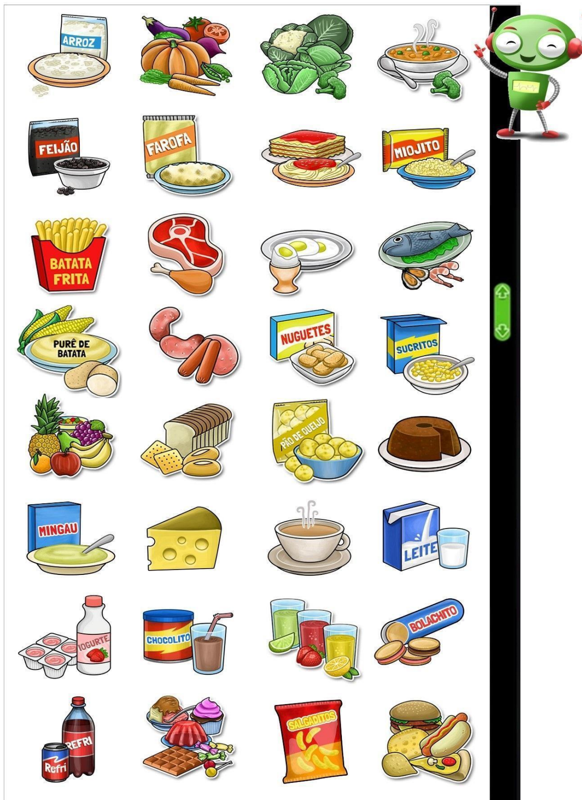
Figure 1. Screenshot of the WebCAAFE questionnaire food options from which the children chose what they consumed the previous day.