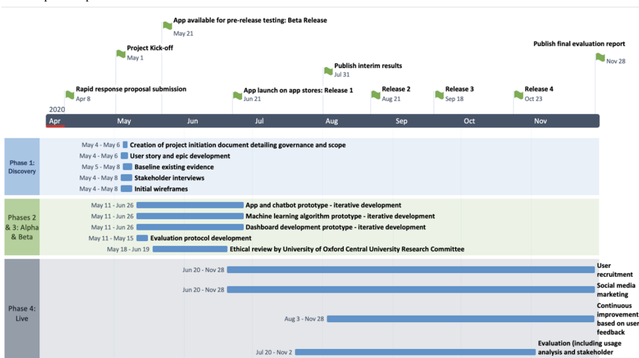
Figure 3. Proposed implementation timeline.

The results will be published in a peer-reviewed journal to share the experience in the development and feedback of the app and contribute to the broader community of researchers tackling the challenges arising from this worldwide pandemic. Figure 3 shows the proposed implementation timeline.