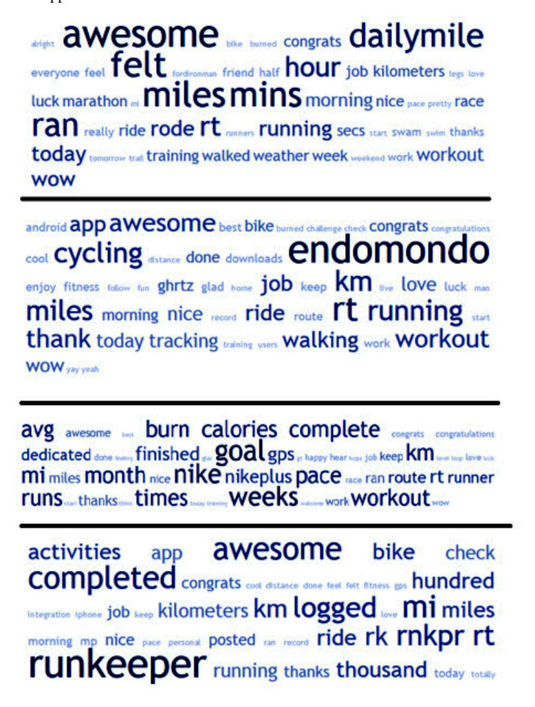
Figure 2. Word clouds by mobile fitness app.