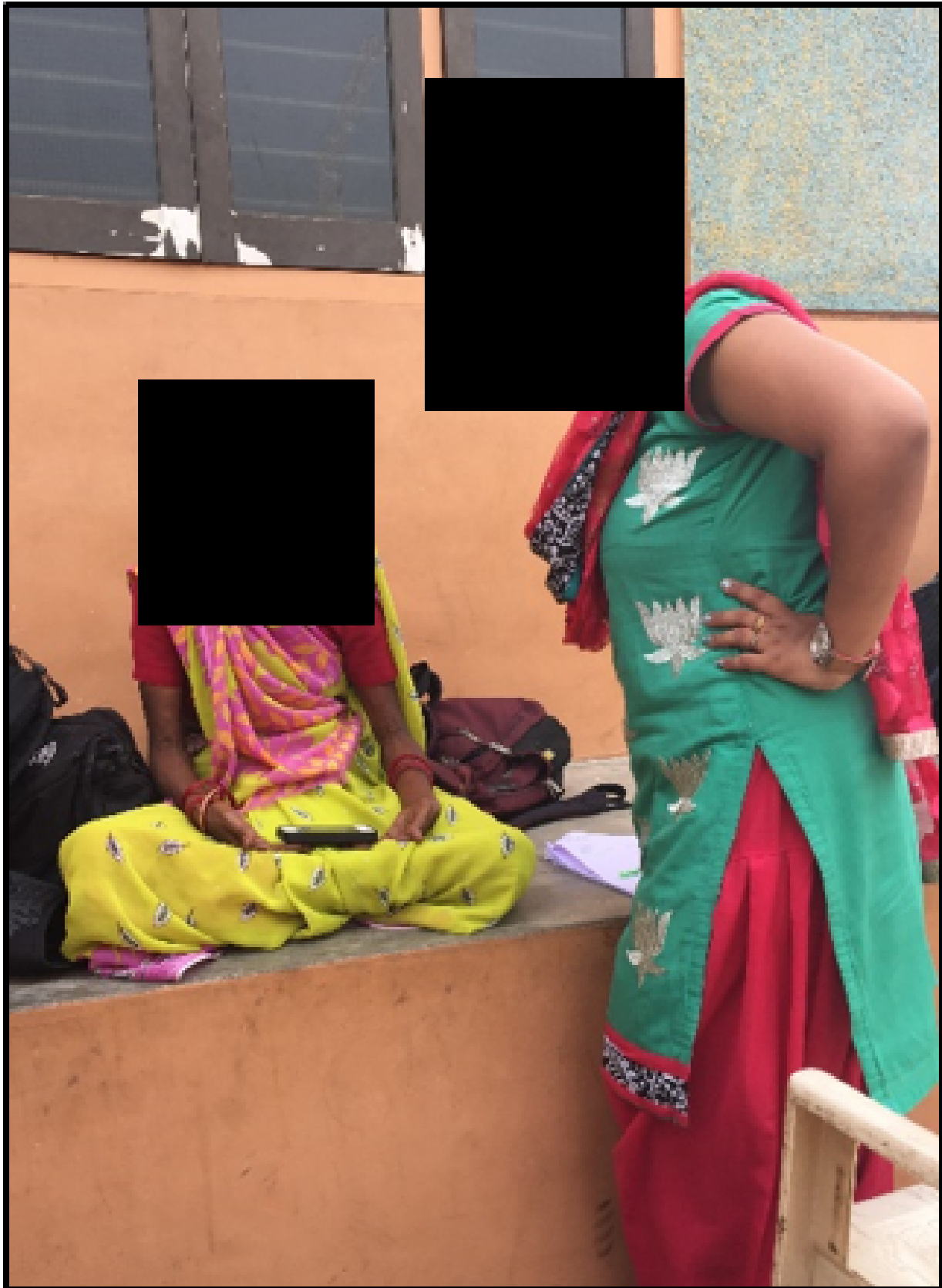
Figure 1. Community health worker screening a study participant for atrial fibrillation using a single-lead ECG device.