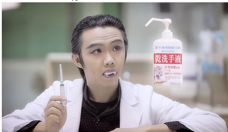
Figure 1. Screenshot of the video “5 moments for hand hygiene.”

From May 5 to December 31, 2014, there were 5252 views of the video, mostly of the Chinese version (3509/5252, 66.81%) (see Figure 1). The production cost was US $6250, so the average cost per click during this period was US $1.20.