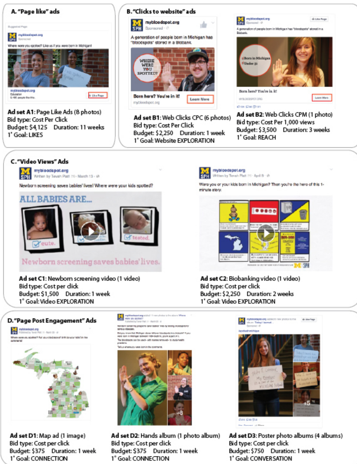
Figure 2. Facebook ad set examples. All ads targeted Michigan residents aged 18-64 years. Ad set A1 included an additional audience of Michiganders aged 18-64 years interested in parenting. Ad set identifiers (A1-D3) correspond with Table 1 and references within the manuscript.