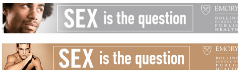
Figure 1. Example Banner Advertisements Used for the American Men's Internet Survey, 2013.

research with MSM, transgender persons were excluded from the study because they are not MSM and recruitment approaches and behavioral risk measures should be specifically designed for this group. Persons who reported being <18 years of age or refused to provide their age were not asked any other screening questions. Persons who reported any gender identity other than male were not asked the sex behavior screening questions.