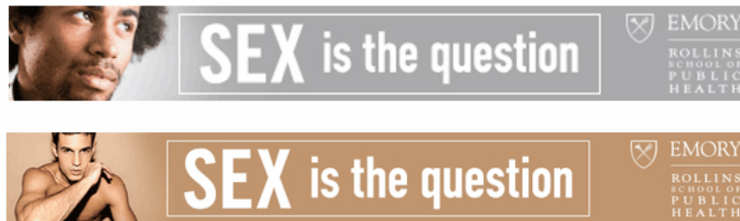
Figure 1. Example Banner Advertisements Used for the American Men's Internet Survey, 2013.

research with MSM, transgender persons were excluded from the study because they are not MSM and recruitment approaches and behavioral risk measures should be specifically designed for this group. Persons who reported being <18 years of age or refused to provide their age were not asked any other screening questions. Persons who reported any gender identity other than male were not asked the sex behavior screening questions.