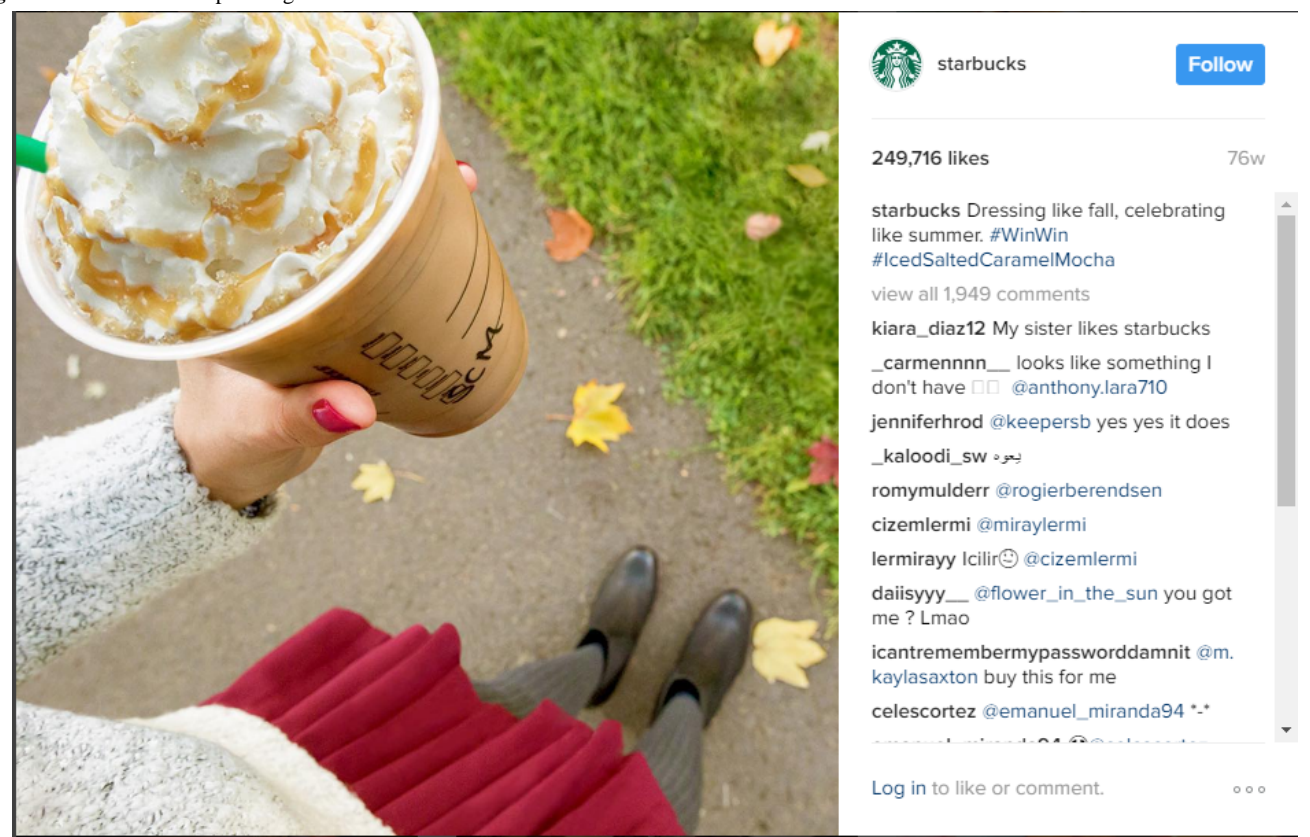
Figure 1. Starbucks example image.

Nutella was the brand with the greatest amount of active interaction through followers liking or commenting on their images or viewing their videos. Nutella (Figure 3) also had the greatest percentage of posts that contained consumer information, such as what the product looks like or how to use it (96.9% of posts). Almost all their posts featured different ways to prepare and eat Nutella, as seen in this example image, demonstrating its perceived versatility and the many ways the product can be incorporated into a consumer's everyday diet. The terms breakfast and start the day were common in Nutella posts, as seen in this caption, as well as incorporation of fruit.